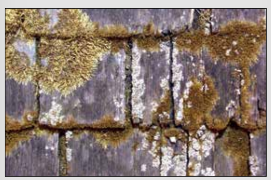
Moss/algae/lichen – Microorganisms that grow on damp organic surfaces.