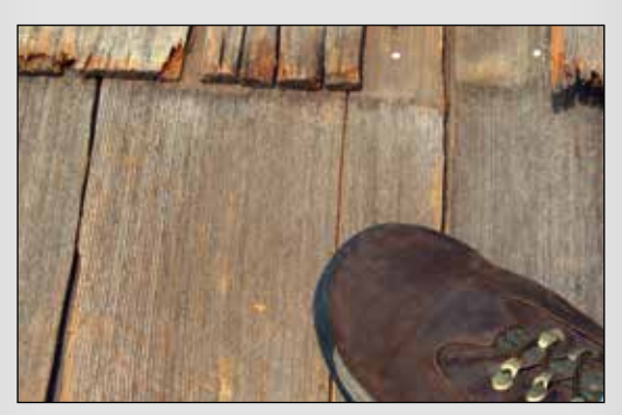
Foot fall – A split resulting from walking on the shingles/shakes.