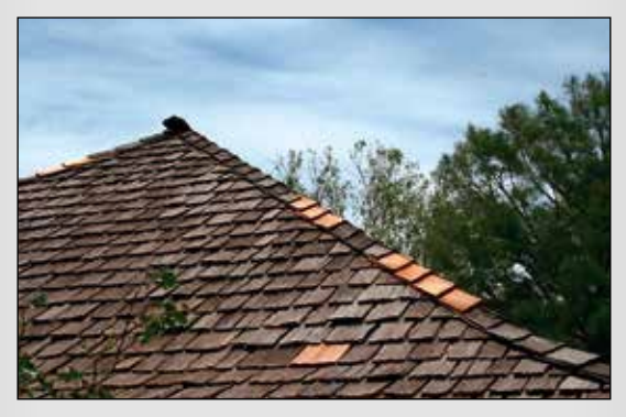
Cedar roof repair – Example of spot repair to wood roof.