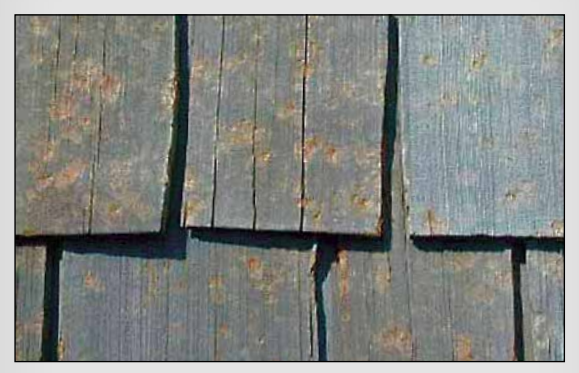
Hail hits - Random hail hits to wood shingles/shakes.