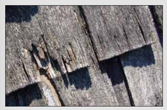
Bottom edge rot – Deterioration of the thick ends of shingles/shakes characterized by fraying.