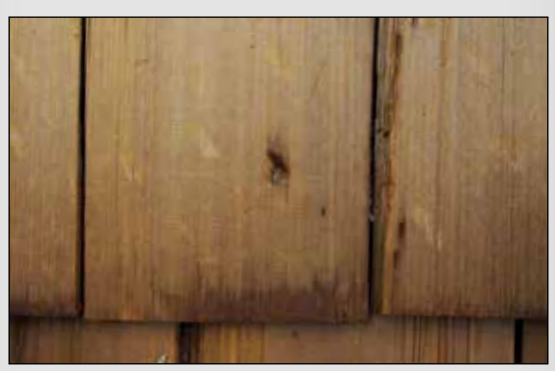
Gouge – A dent in a shingle/shake which may or may not be caused by hail.