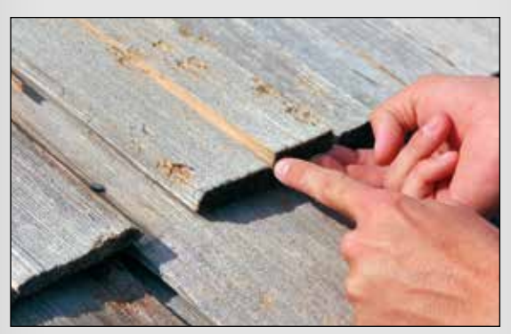
Impact split – Splits in wood shingles associated with impact marks, having sharp edges and a fresh wood color (light orange).