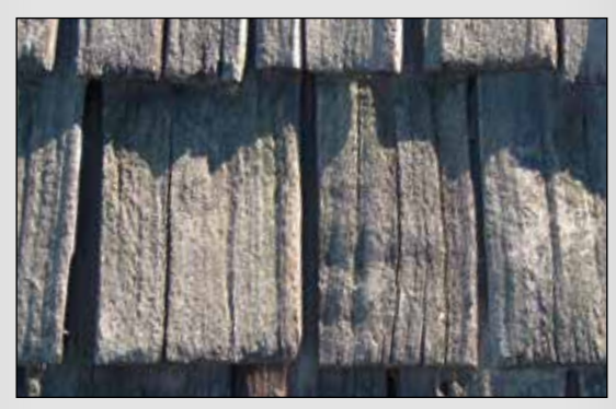
Weathered split – A split in wood caused by exposure to natural weathering. Such splits have rounded edges and a gray or dull orange interior.