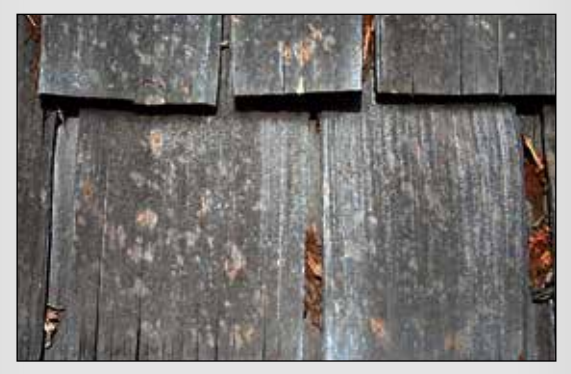
Spatter marks – Random hail which removes the weathered look to shingles/shakes, but doesn't damage the roof.