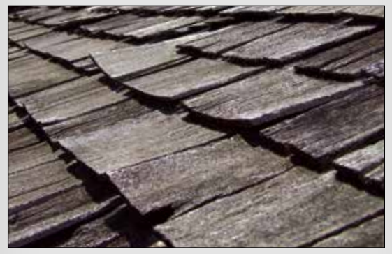
Cupping and curling – A natural aging process of the wood roof where a portion of the shingle/shake is distorted and is curled upward.