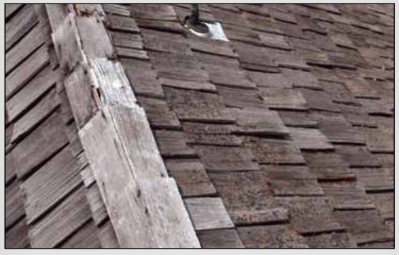
Directional hail – The number, size and hardness of the hailstones can vary tremendously within a small locality. Velocity and direction of the wind are also factors.