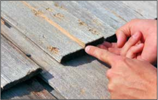
Impact split – Splits in wood shingles associated with impact marks, having sharp edges and a fresh wood color (light orange).