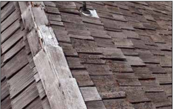
Directional hail – The number, size and hardness of the hailstones can vary tremendously within a small locality. Velocity and direction of the wind are also factors.