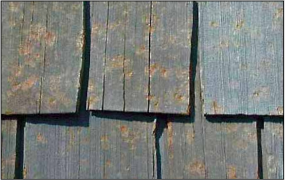
Hail hits – Random hail hits to wood shingles/shakes.